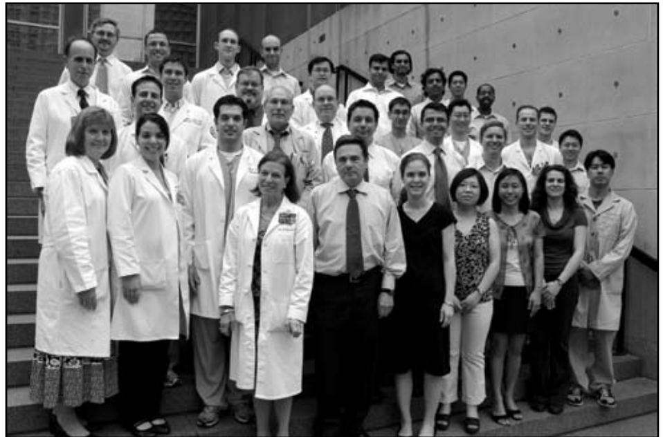
Graduating residents and fellows stand alongside Northwestern Radiology faculty members as they look forward to new beginnings.