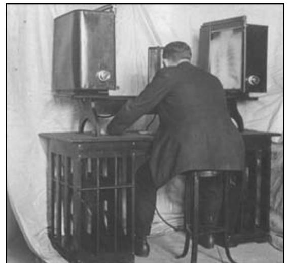
Dr. Case using a Wheatstone stereoscope to get a 3-D view of a chest X-ray.